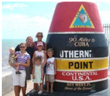
The Ellis crew in Key West, the day before our first road-trial (Key West to Tampa, 479 miles in six days) this past Aug 7-12.